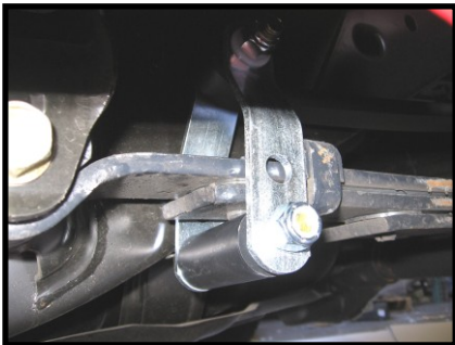
Front Shackle in lower bolt hole