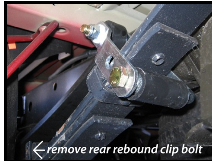
Rear Shackle in lower bolt hole

Should you have any questions please call the SuperSprings toll-free tech support @ 866-898-0720