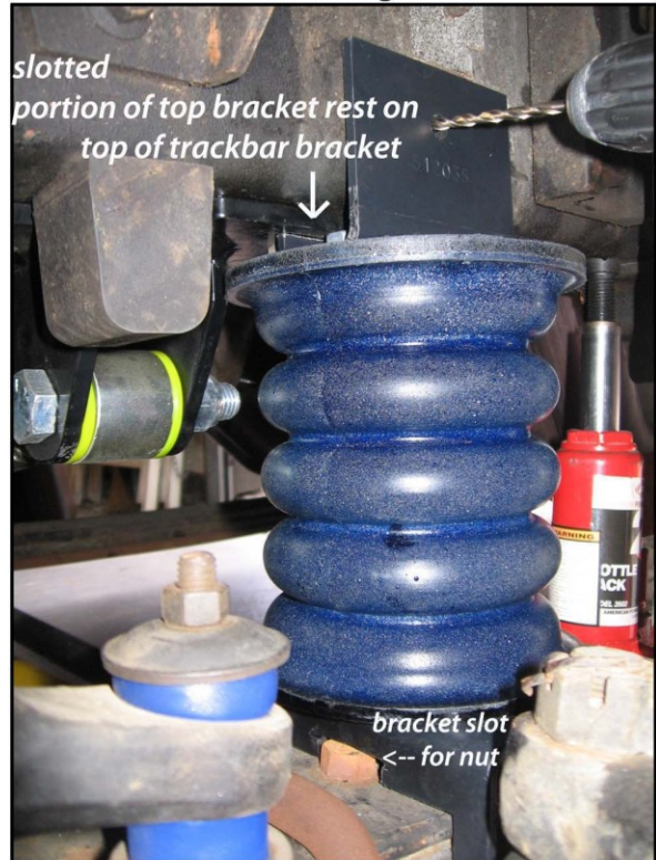
slotted portion of top bracket rest on top of trackbar bracket