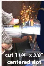
cut 1 1/4" x 3/8" centered slot Slot both passenger and drive side bottom bracket