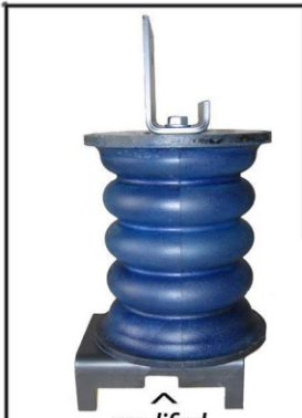
modified Front Passenger's Side SumoSprings SSF-181 Uninstalled