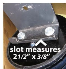
slot measures 2 1/2" x 3/8" Modify driver's side top bracket