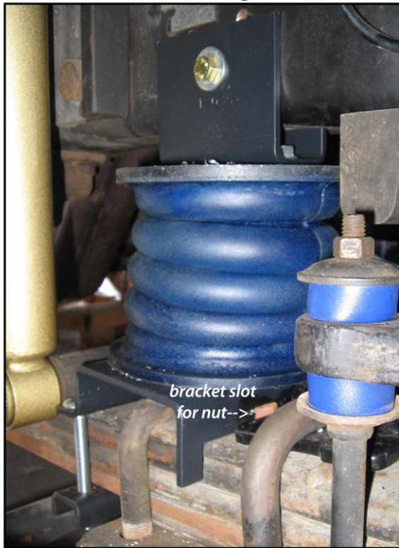
bracket slot for nut-->